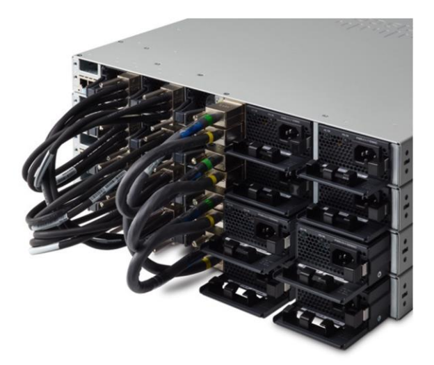
Figure 4. Cisco Catalyst 9300 Series StackPower