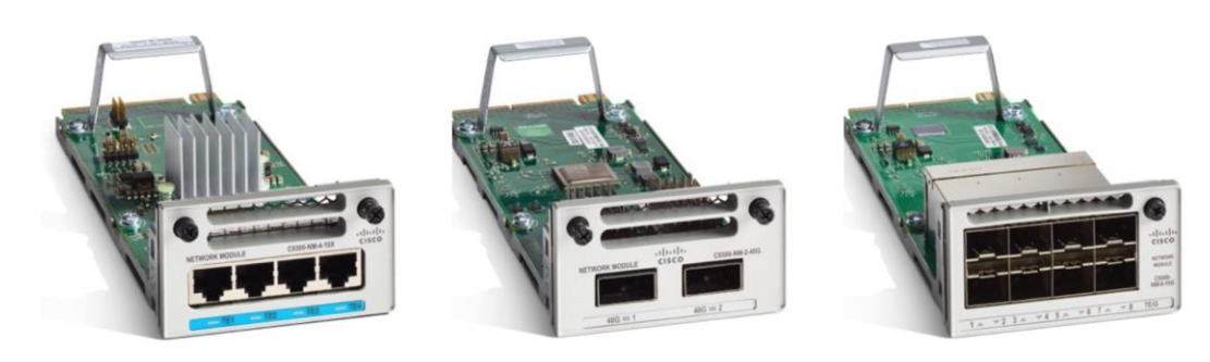
Table 2. Network module numbers and descriptions