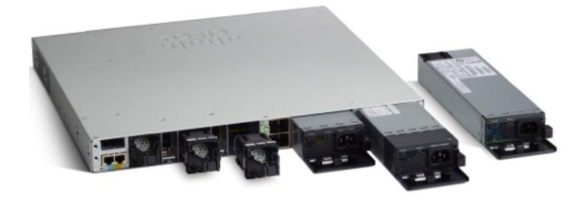
Table 3 lists the different power supplies available in these switches and available PoE power.